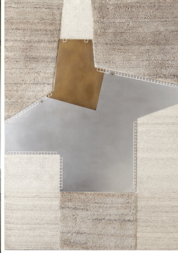
David Kaihoi designs, clockwise from top right: Controposto with Hood wool and metal rug 55745 , Blocks wallpaper 5008340 , XY hand-knotted wool rug 72431 , Turkish Step fabric 71240 . Fabric and wallcovering, both Schumacher, fshumacher.com . Rugs, all PFM, pattersonflynnmartin.com .