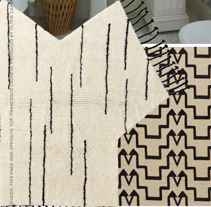
PRECEDING SPREAD AND OPPOSITE BOTTOM LEFT: MELANIE A. FIEVEDO. THIS PAGE AND OPPOSITE TOP: FRANCESCO L'AGNÈSE. PRODUCED BY OLIVIA CAPOIGNIRO.