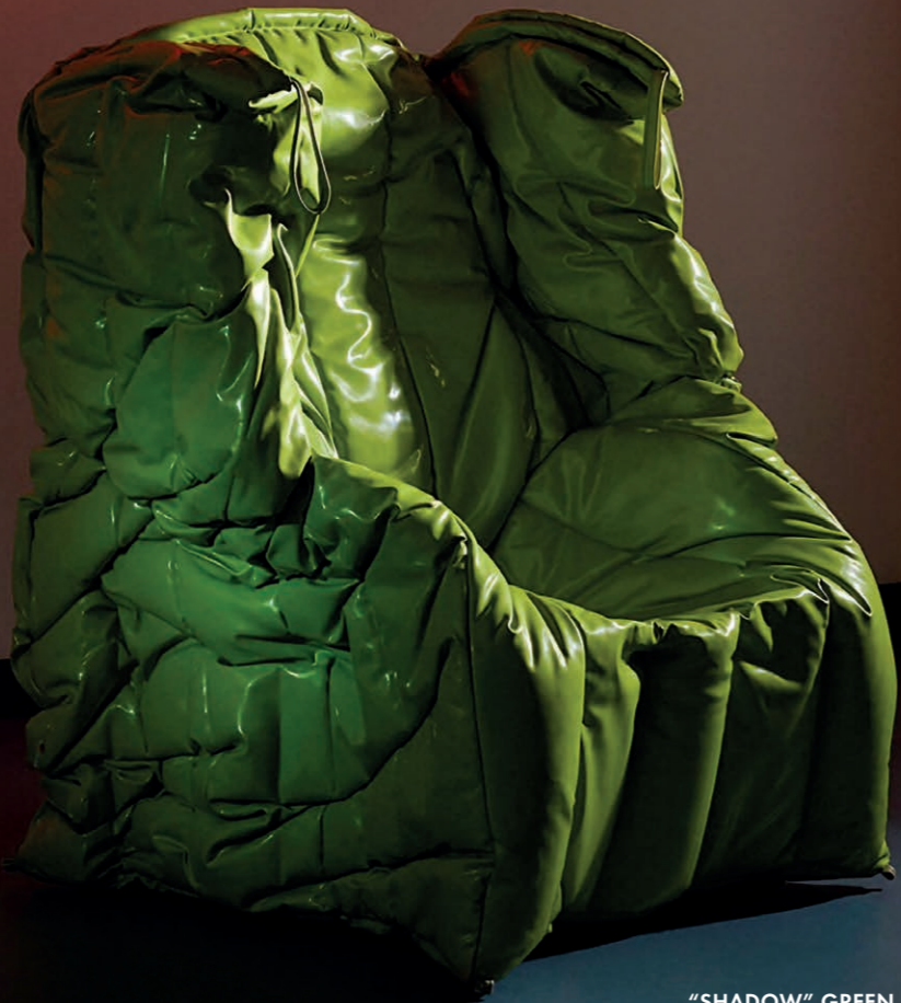
"SHADOW" GREEN COATED FABRIC ARMCHAIR designed by Gaetano Pesce for Meritalia, ₹4,44,041

TREND AND STYLE DIRECTION BY YASHIKA PUNJABEE TEXT BY NAMRATA DEWANJEE PRODUCED BY APEKSHA RAO