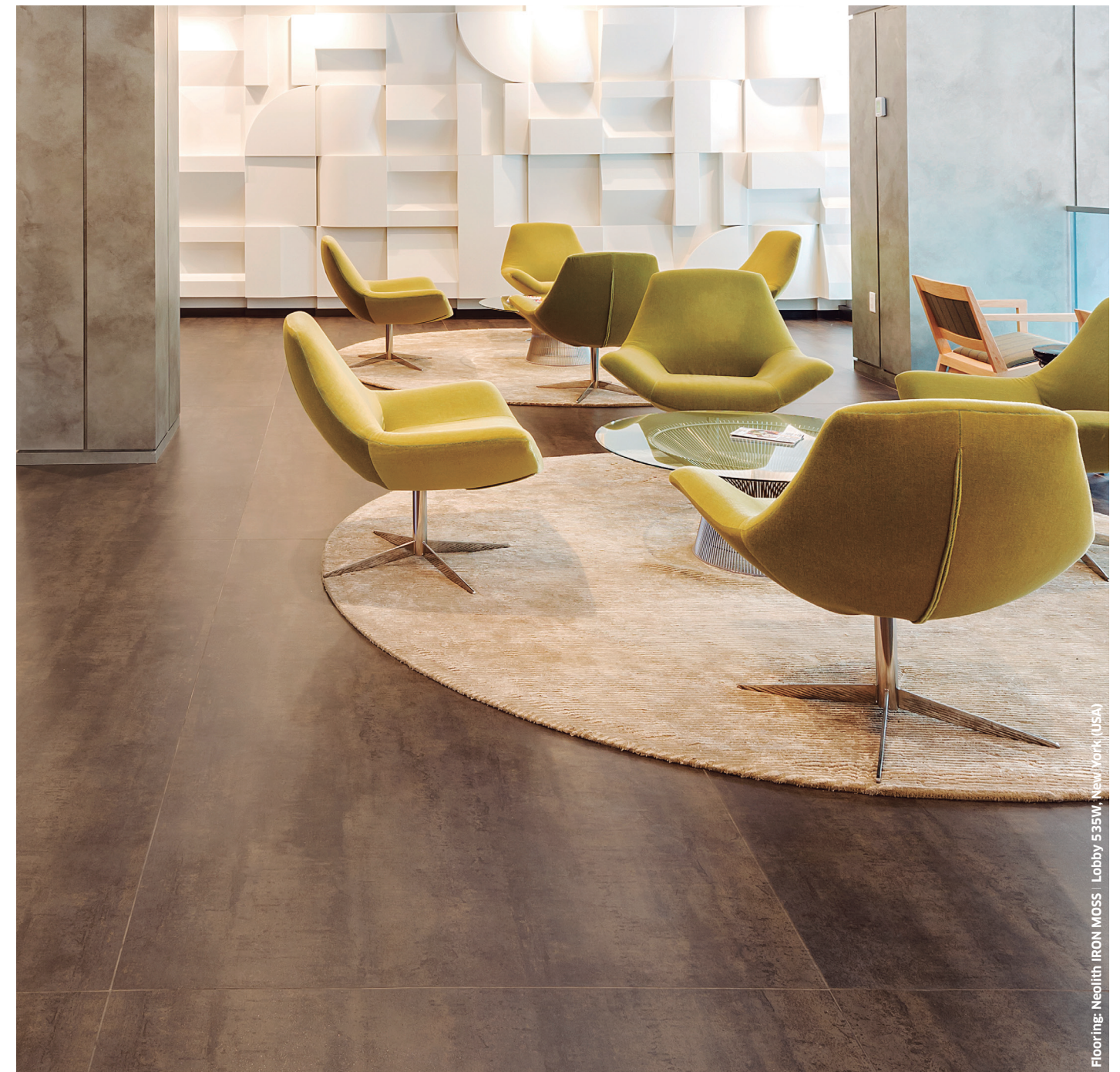
Flooring: Neolith IRON MOSS | Lobby 535W, New York (USA)

NEOLITH®: DESIGN, VERSATILITY, DURABILITY, SUSTAINABILITY.