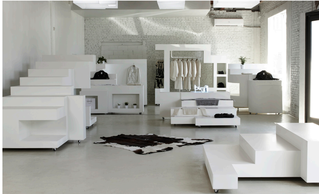
Frankie clothing boutique in Downtown Los Angeles, by Bureau Spectacular.

The comic book sensibility of Bureau Spectacular delves beyond the superficial with spaces that encourage the occupants to live a less ordinary life.